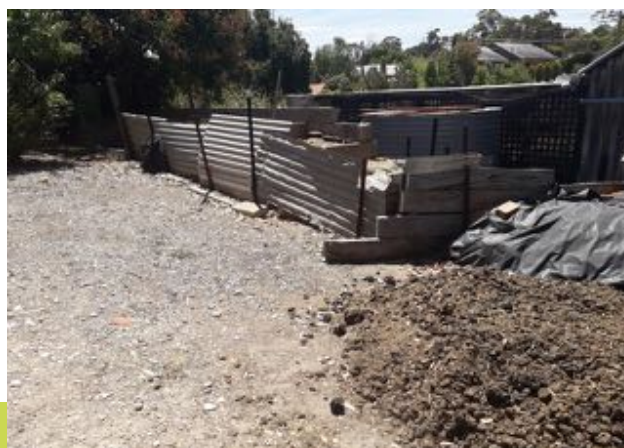
Compost bays Feb 2021