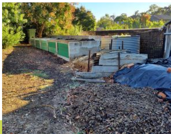
Compost bays March 2021